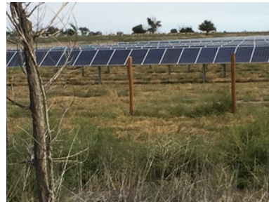
Alternate use of Farmland

From the plains in Eastern Colorado to the “Fourteeners” that dot the Rocky Mountains, from the top of Pike’s Peak to the bottom of the Colorado River Gorge there is much to see and experience. Join the Rural Chaplains Association in exploring the Arkansas River Valley Region.