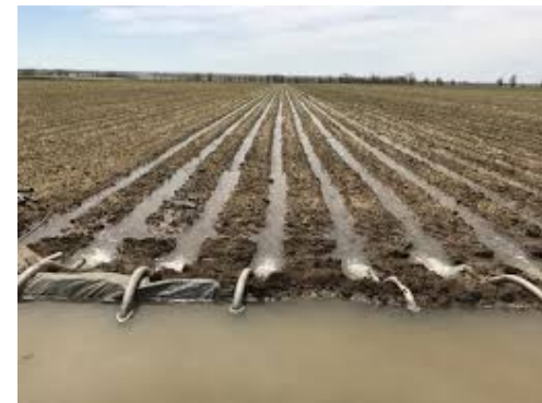
Irrigated Farm in Crowley County (General area the group will visit)